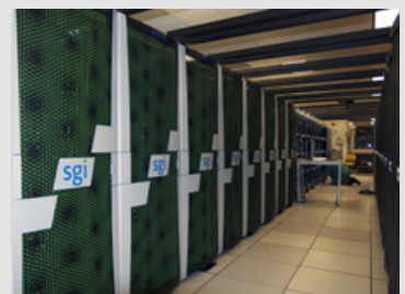
NASA's Pleiades supercomputer's advanced processing power enabled the high-resolution replication of cyclone Nargis' formation five days in advance.

"We know what's happening across very large areas. So, we need really good, high-resolution simulations with the ability to detail conditions across the smallest